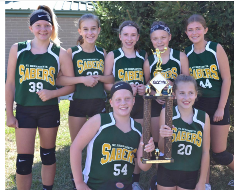
Seventh Grade Girls Volleyball Champs!

We are grateful for ALL the coaches and players this year. Thank you for your time and effort.