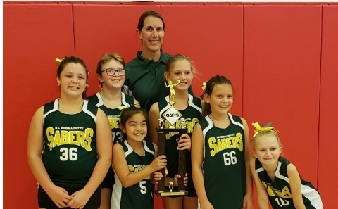
Fifth Grade Girls Volleyball Champs!

We are grateful for ALL the coaches and players this year. Thank you for your time and effort.