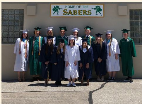
St. Bernadette's Class of 2015 returned in high school graduation regalia. Current students cheered and congratulated them!