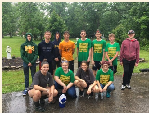
The Class of 2019 braved rainy weather to update the landscaping in our parish grotto.